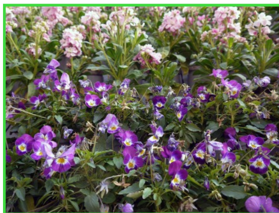
Application Categories: Living Walls

Hy-Tex (UK) Limited Aldington Mill, Mill Lane, Aldington, Ashford, Kent TN25 7AJ